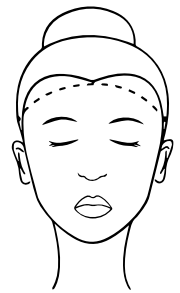
EAR TO EAR ACROSS FOREHEAD