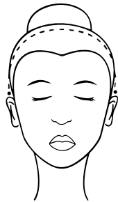
EAR TO EAR ACROSS TOP